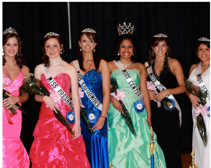
2010 Miss Centurion Pageant