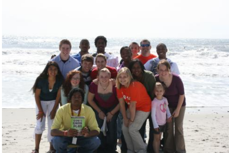
2009 FCA Garden Retreat