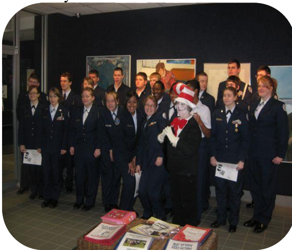
AFJROTC with Cat in the Hat

AFJROTC visited Cannons Elementary on Tuesday, March 2 nd to participate in Read Across America. The AFJROTC read to the elementary students and met Cat in the Hat.